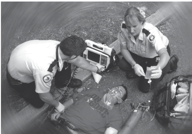
Our paramedics use the latest in technology such as the Lifepak 12 cardiac monitor, considered a key to the pre-hospital evaluation of a heart attack.